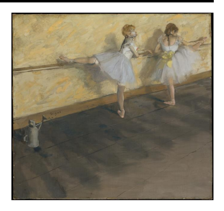
Figure 2. Edgar Degas. Dancers Practicing at the Barre. 1877. Metropolitan Museum of Art, New York.

In Dancers Practicing at the Barre (1877) (Fig. 2), Degas uses an off-centered composition and unusual perspectives of the human body to depict flexibility, posture, and balance.